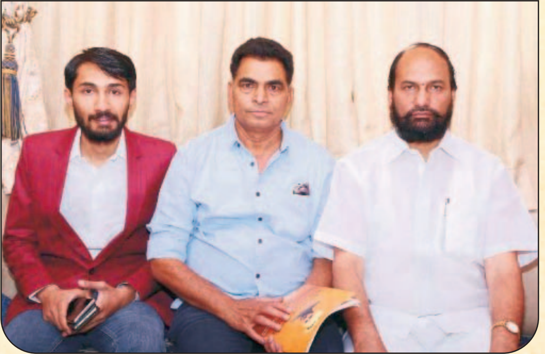
हिंदी, मराठी और दक्षिण भाषीय सिनेमा के सुप्रसिद्ध अभिनेता सयाजी शिंदे के साथ.