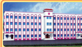
Adv. Shardul Sudhakar Rao Jadhavar Educational Campus (2), Narhe, Pune-41

Surekhatai Sudhakar Rao Jadhavar Educational Campus (3), Vadgaon Bk, Pune-41.