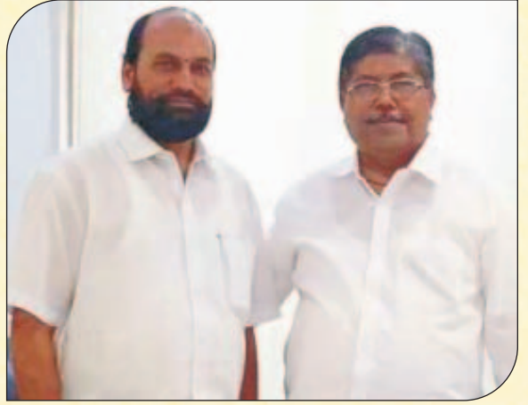
मा. ना. चंद्रकांतदादा पाटील के साथ.