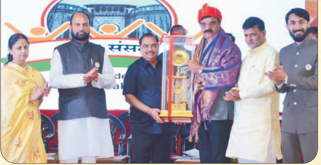
स्वच्छता अभियान के अंतर्गत मंत्री विजय शिवतारे (आदर्श मंत्री), माजी मंत्री एकनाथराव खडसे, महाराष्ट्र विधानपरिषद के सदस्य कै. आ. विनायकराव मेटे.