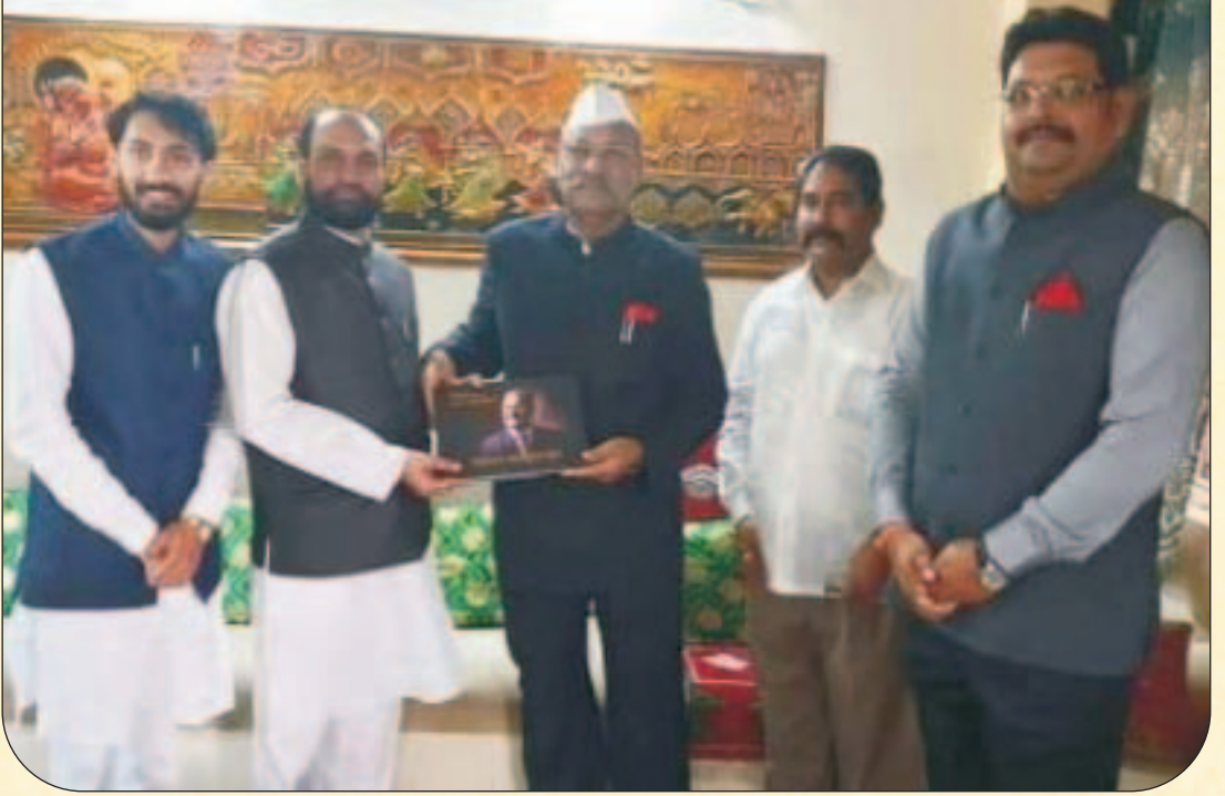
आदर्श माता पुरस्कार प्रदान करते समय माजी राज्यपाल व खासदार श्रीनिवास पाटील के साथ.