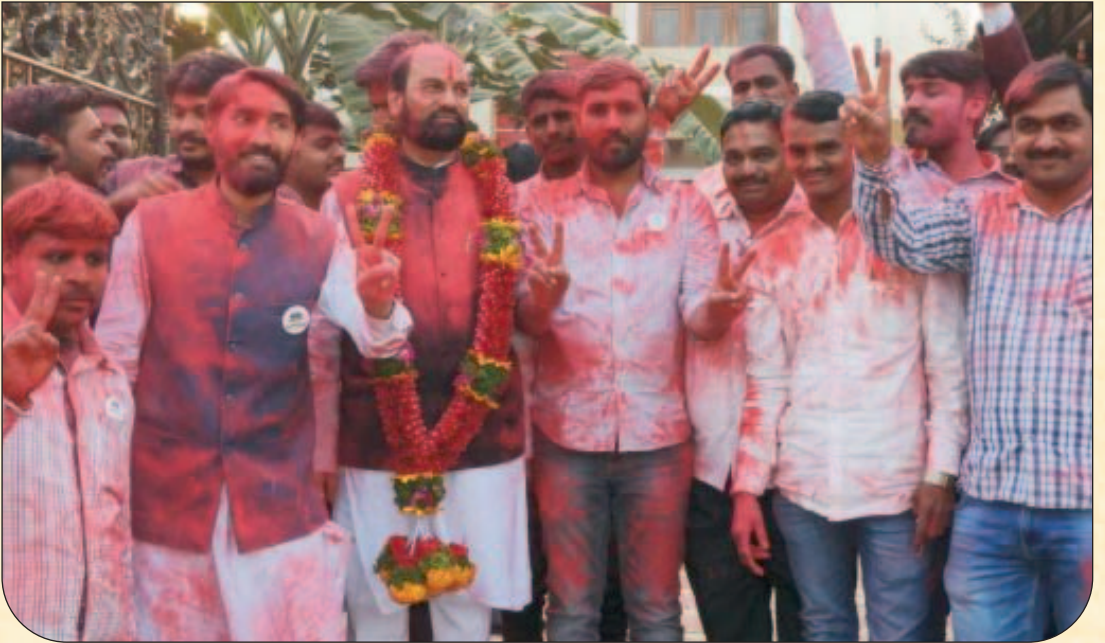
सावित्रीबाई फुले पुणे विद्यापीठ के प्रबंधन परिषद पर निर्विरोध चयन हुआ