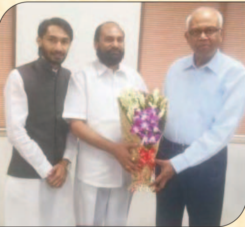
पद्मविभूषण श्री. रघुनाथ माशेलकर के साथ