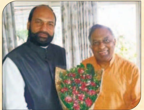
पद्मभूषण श्री. विजय भटकर के साथ