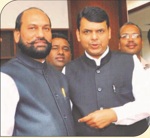
मा. मुख्यमंत्री देवेन्द्र फडणवीस के साथ