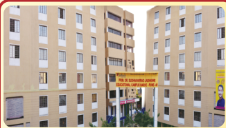
Prin. Dr. Sudhakar Rao Jadhavar Educational Campus (1), Narhe, Pune-41

Phone - 8459781648 www.jadhavarcbsc.co.in