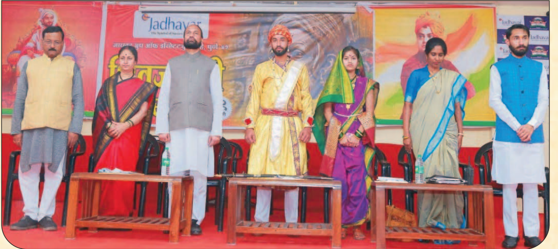
शिवजयंती महोत्सव कार्यक्रम