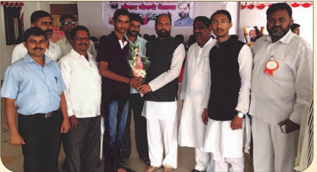
पहले रोजगार मेला मे आयोजित प्रथम नौकरी प्राप्त विद्यार्थीयों का सत्कार करते हुये ।